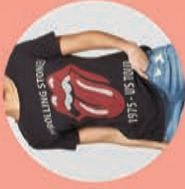
T-SHIRTS (NO WHITE T-SHIRTS)