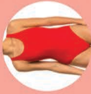
ONE PIECE SWIMSUIT