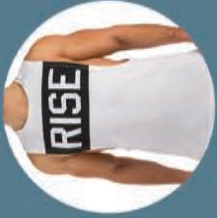
NO SIDE CUT TANK TOPS