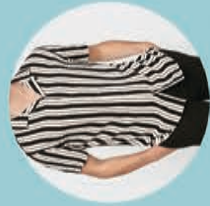
BUTTON UP SHIRTS