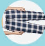
PAJAMA PANTS (EXCEPT FOR BREAKFAST)