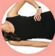
TANK TOPS (THICK STRAPS)