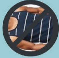
NO TANK TOPS