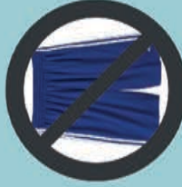
NO GYM SHORTS