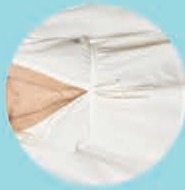
LOW NECK TOP