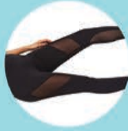
SHEER LEGGINGS (REGULAR LEGGINGS PERMITTED)