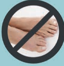
NO BARE FEET