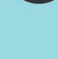
NO BARE FEET